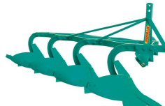
Product ABOLLO MOULDBOARD PLOUGH