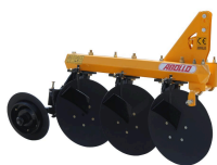
Product ABOLLO DISC PLOUGH