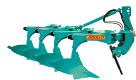
Product HYDRAULIC ADJUSTABLE FULL AUTOMATIC PLOUGH