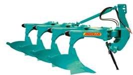
Product HYDRAULIC ADJUSTABLE FULL AUTOMATIC PLOUGH