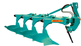
Product HYDRAULIC ADJUSTABLE FULL AUTOMATIC PLOUGH