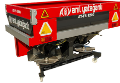
Product Double Disc Hydraulic Horizontal Mixer Fertilizer Spreader