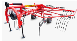
Product Rotary Hay Rake