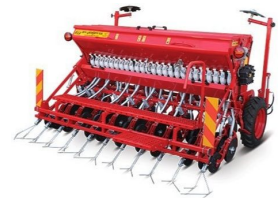
Product Universal Seed Drill