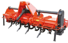
Product Rotary Cultivators