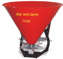
Product Fertilizer Spreader