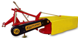
Product Rotary (Drum) Mower