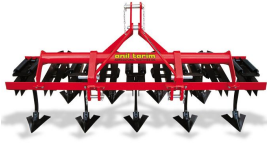
Product Spring Cultivator