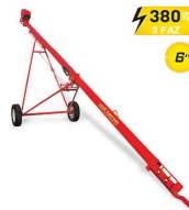
Product Electric Powered Auger Conveyors