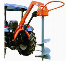
Product Post Hole Digger