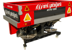
Product Double Disc Hydraulic Horizontal Mixer Fertilizer Spreader