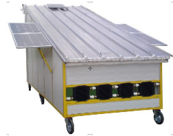
Product Solar Energy Collectors / Panels