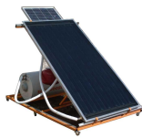
Product Solar Energy Collectors / Panels