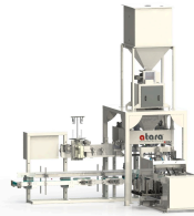
Product Toz / Bakliyat / Gübre Paketleme Makineleri