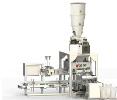
Product Ambalajlama Makineleri