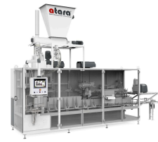
Product Feeder Filling Machine