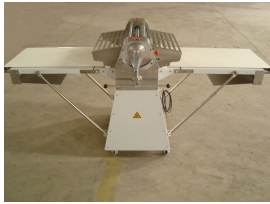
Product Dough Spreading Machine