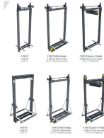
Product ELEVATOR CAR FRAME