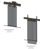
Product ELEVATOR DOOR