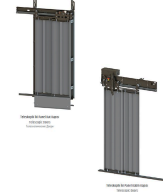
Product ELEVATOR DOOR