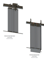
Product ELEVATOR DOOR