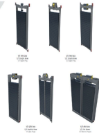
Product ELEVATOR COUNTER WEIGHT