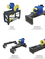
Product ELEVATOR MACHINE POD