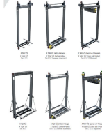
Product ELEVATOR CAR FRAME