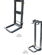
Product ELEVATOR CAR FRAME