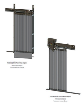
Product ELEVATOR DOOR