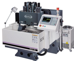
Product CNC Vertical Processing Center