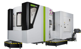
Product cnc Horizontal Processing centers