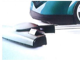
Product Low Pressure Filter