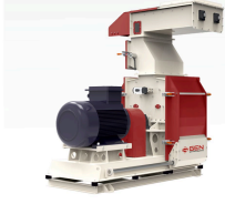
Product Hammer Mill