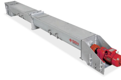
Product Screw Conveyor