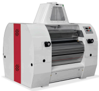
Product Roller Mill