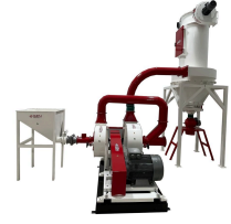
Product Whole Grain Flour Mill