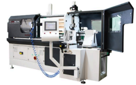
Product SIRAYET (ROVELLER) SPEED LATH