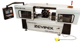
Product 2 AXIS WOOD CNC MACHINE