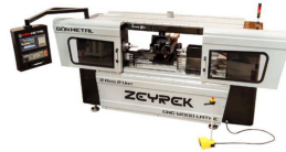
Product 2 AXIS WOOD CNC MACHINE