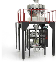
Product BM-W PACKAGING MACHINE WITH MULTIHEAD WEIGHER