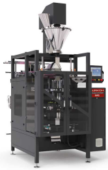
Product IMQ-A QUADSEAL PACKAGING MACHINE WITH AUGER FILLER