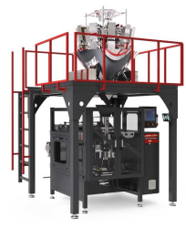
Product IM-W PACKAGING MACHINE WITH MULTIHEAD WEIGHER