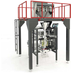
Product BM-L Lineer Terazili Paketleme Makinesi