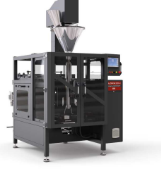
Product IM-A PACKAGING MACHINE WITH AUGER FILLER