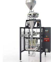
Product BM-V Volumetrik Paketleme Makinesi