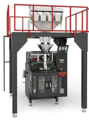
Product IM-L PACKAGING MACHINE WITH LINEAR WEIGHER