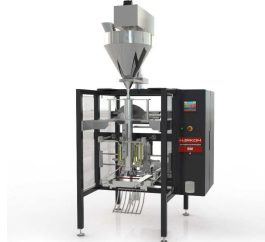
Product BM-A Vidalı Paketleme Makinesi