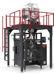
Product IMQ-W QUADSEAL PACKAGING MACHINE WITH MULTIHEAD