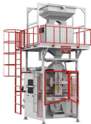
Product BM-XL Lineer Terazili Paketleme Makinesi