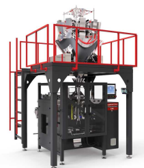
Product CM-W PACKAGING MACHINE WITH MULTIHEAD WEIGHER