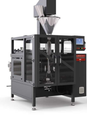
Product IM-A PACKAGING MACHINE WITH AUGER FILLER