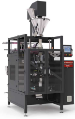
Product IMQ-A QUADSEAL PACKAGING MACHINE WITH AUGER FILLER