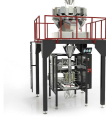
Product BM-W PACKAGING MACHINE WITH MULTIHEAD WEIGHER