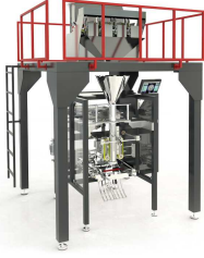
Product BM-L Linear Terazili Paketleme Makinesi