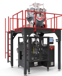
Product CM-W PACKAGING MACHINE WITH MULTIHEAD WEIGHER