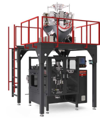
Product IM-W PACKAGING MACHINE WITH MULTIHEAD WEIGHER