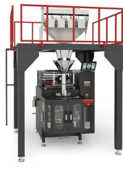
Product IM-L PACKAGING MACHINE WITH LINEAR WEIGHER