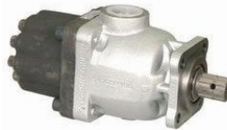
Product Flat Axial Piston Pump