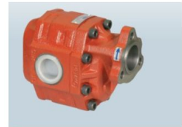
Product Gear Pump