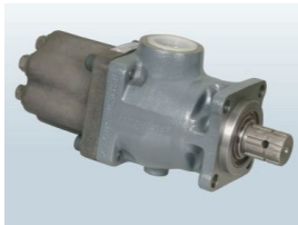
Product Flat Axial Piston Pump