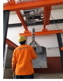
Product Laboratory Tests