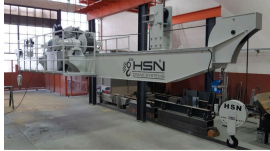
Product Provision crane