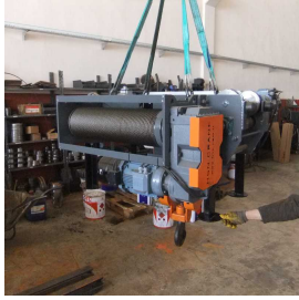
Product Single-Slide Crane