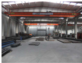
Product Mobile Crane