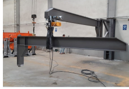
Product Jib Crane