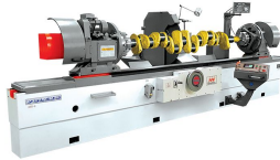
Product Engine Renewal Machine