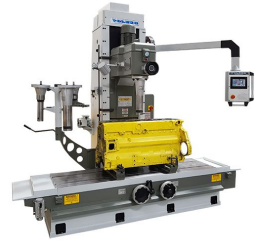
Product Engine Renewal Machine