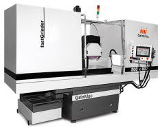
Product Surface Grinding Machine