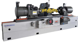
Product Engine Renewal Machine