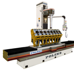
Product Engine Renewal Machine