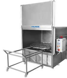
Product Industrial Lump Washing Machine