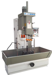
Product HYDRAULIC HONING MACHINE