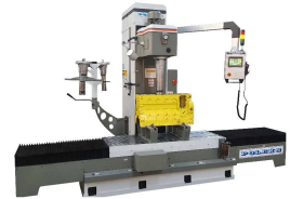
Product Engine Renewal Machine