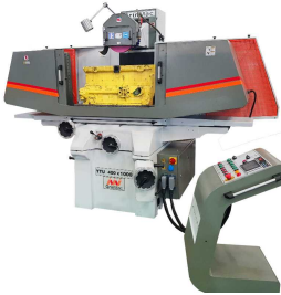
Product Surface Grinding Machine