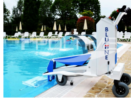
Product HV 82 POOL LIFT