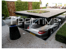
Product OTO 62 PARKING LIFT