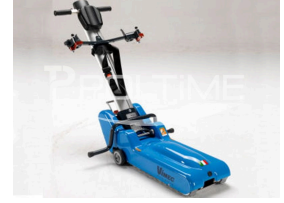
Product PT 90 TRACKED LADDER CLIMBING