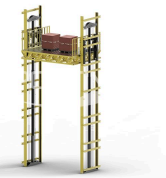
Product CYK 50 DOUBLE SIDED HYDRAULIC LOAD PLATFORMS