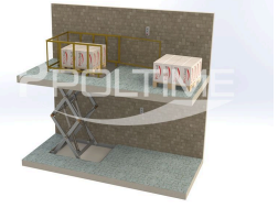
Product YMK SCISSOR LIFT PLATFORMS