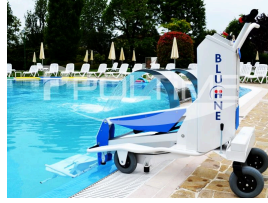
Product HV 82 POOL LIFT