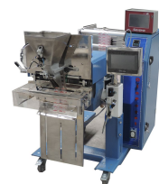
Product Automatic Packaging Machine