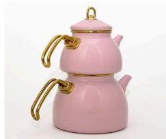
Product Ottoman Teapot