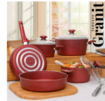
Product Aluminum DeepPot