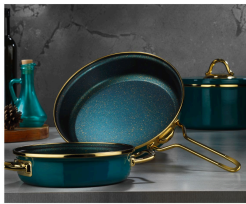
Product Granite Chef Pan