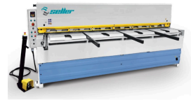
Product Gear Motorised Guillotine Shear