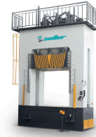
Product Hydraulic Deep Drawing Presses