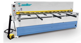
Product Gear Motorised Guillotine Shear