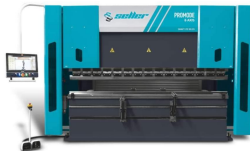
Product Bending Press