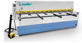
Product Gear Motorised Guillotine Shear