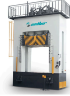
Product Hydraulic Deep Drawing Presses