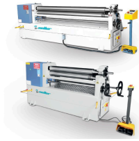
Product Rolls Plate Bending Machines