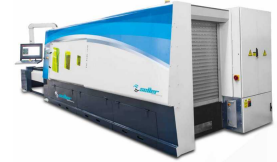
Product Fiber Laser Cutting Machine