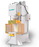
Product C TYPE Hydraulic Presses