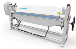
Product Folding Machine