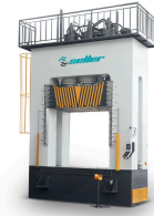
Product Hydraulic Deep Drawing Presses