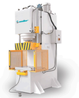
Product C TYPE Hydraulic Presses