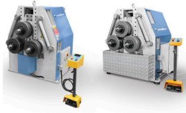
Product Pipe Bending Machine