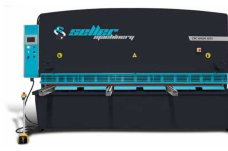
Product CNC Hydraulic Guillotine