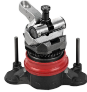
Product Caliper Repair Kits