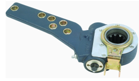
Product Brake Adjuster