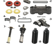
Product Caliper Repair Kits