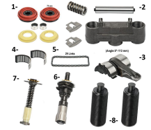
Product Caliper Repair Kits