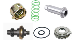
Product Caliper Repair Kit