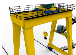
Product Rotary Lifting Unit