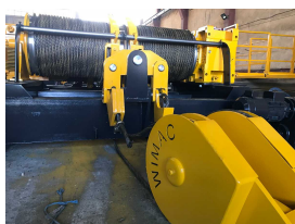
Product Trolley Hoist