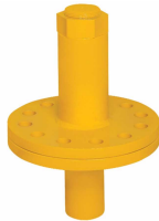
Product Levelling Shovel Rotary