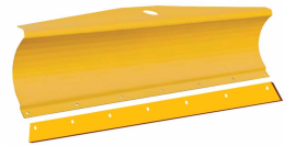
Product Land Levelling Blade