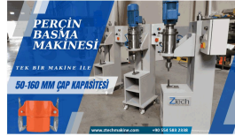
Product RIVET PRESS