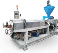
Product Twin Screw Extruder