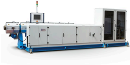
Product SINGLE SCREW EXTRUDER